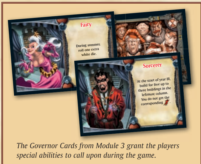
The Governor Cards from Module 3 grant the players special abilities to call upon during the game.